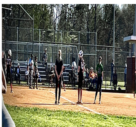
PSMS Softball Team playing Algood Redskins