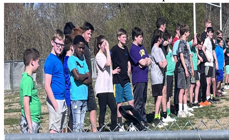
PSMS Football Strength and Conditioning